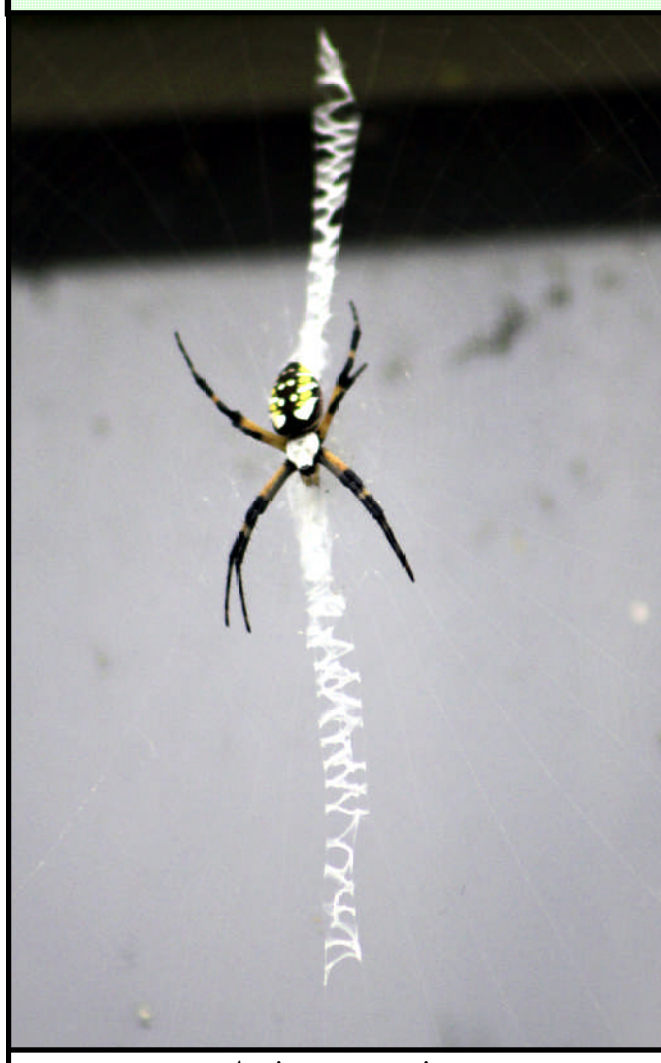
Argiope aurantia black and yellow garden spider See page 2

How come it takes so little time for a child who is afraid of the dark to become a teenager who wants to stay out all night?